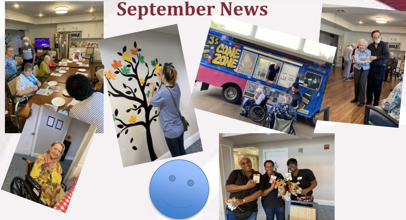
Some of the many activities we did during the month of September.