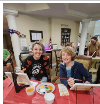
Our painting party with residents and family