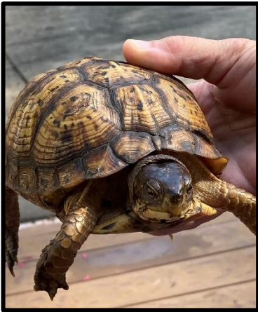
Our pet "Pickles".